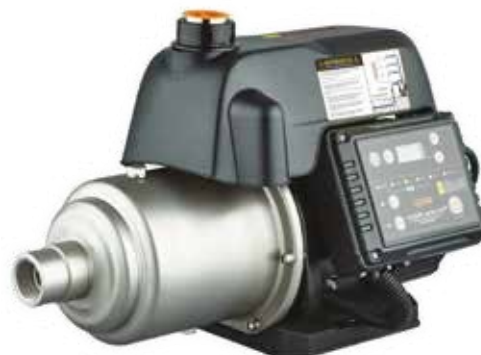
MAGNET AUTO 750