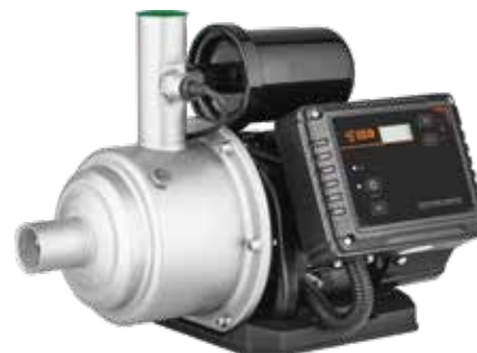
HP INOX AUTO